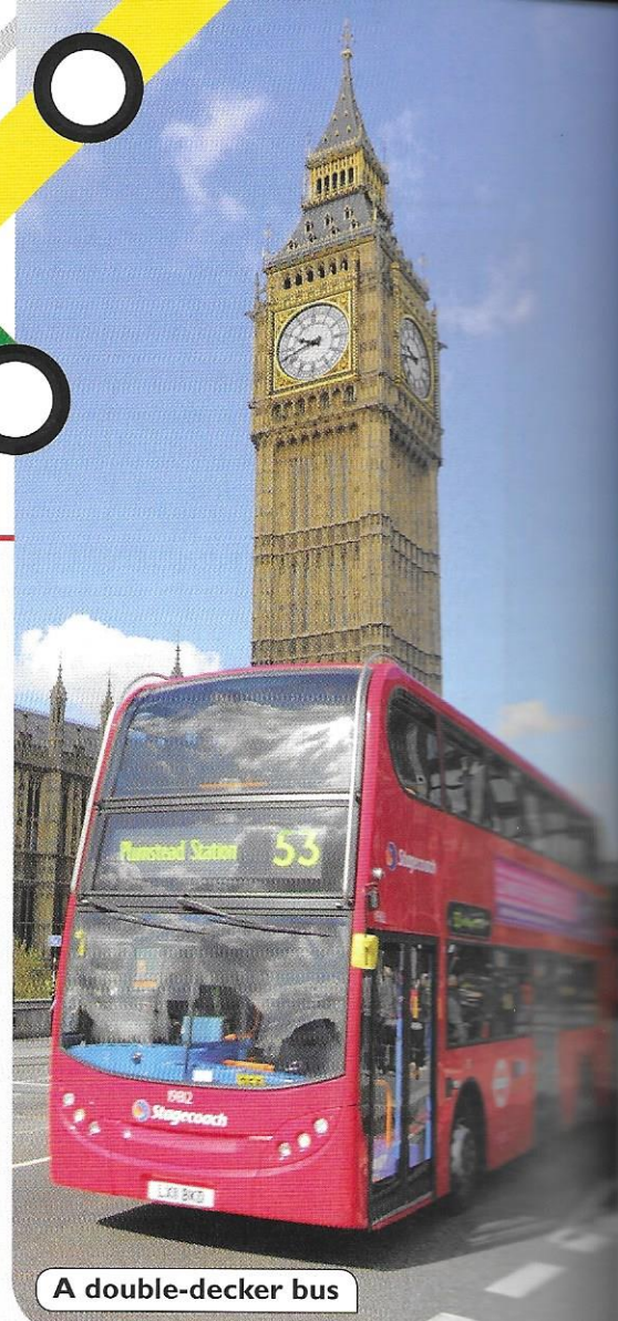
A double-decker bus